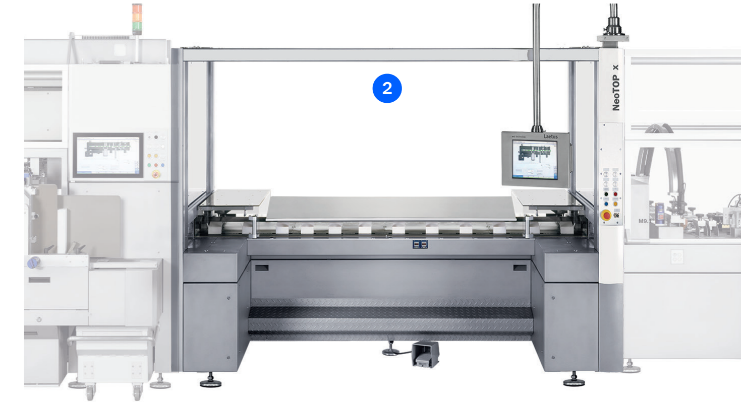
output packs / year / shift: manual to semi automated: from 100'000 to 3 mio.