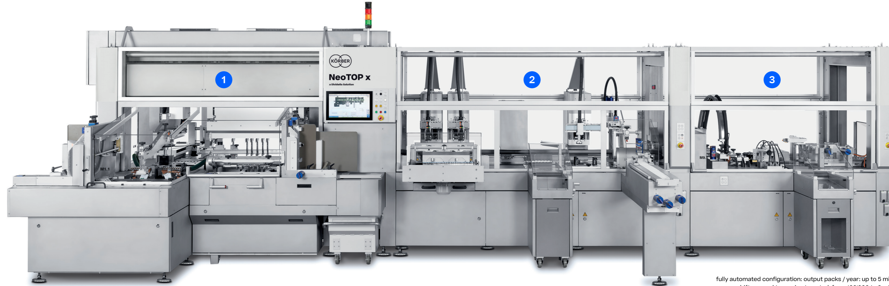
fully automated configuration: output packs / year: up to 5 mio. shift: manual to semi automated: from 100'000 to 3 mio.